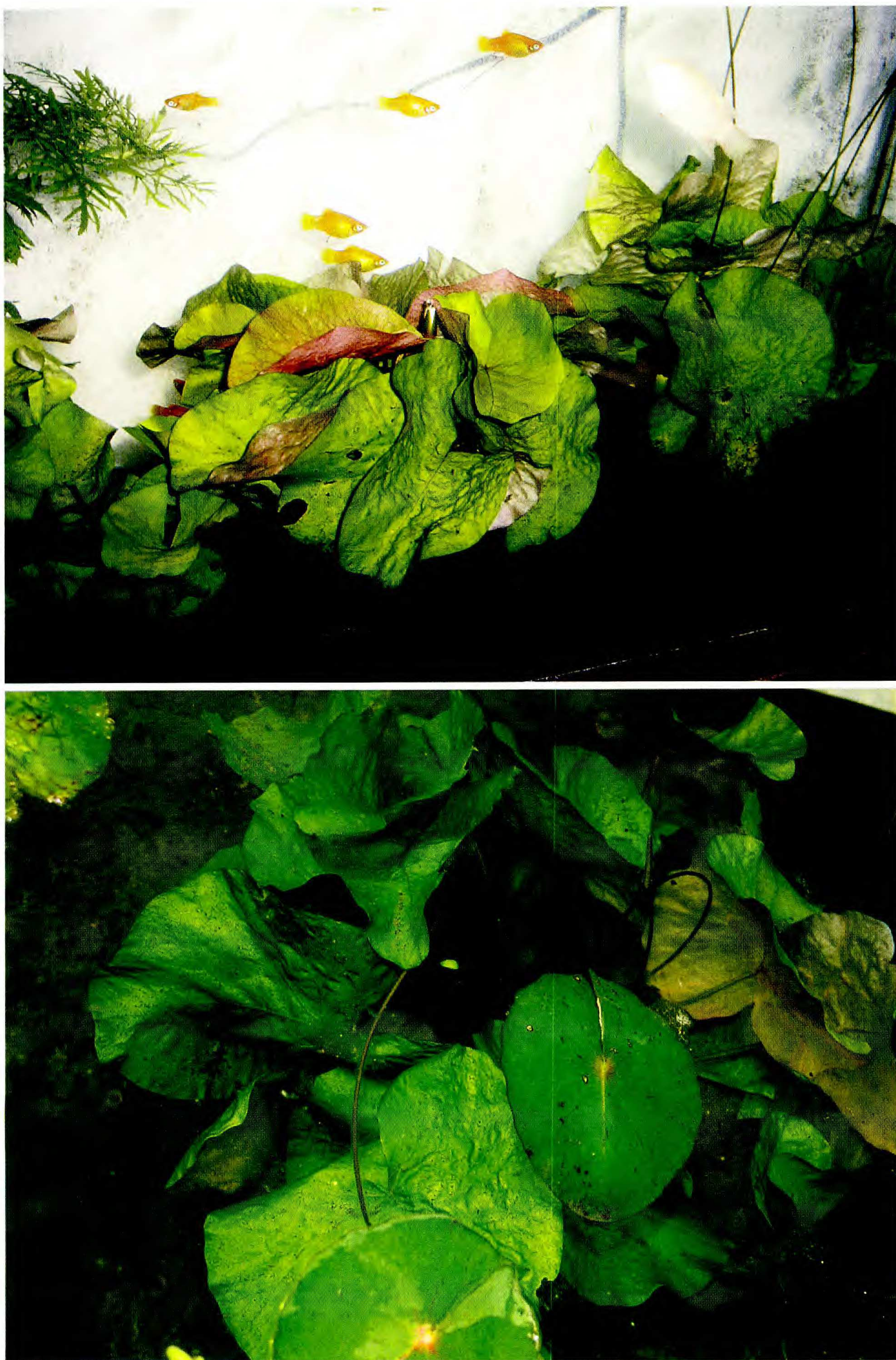
FIG. 3. Top, submerged plants under artificial light in an aquarium, not submerged bud on center plant. Bottom, submerged plant grown in pond under nature conditions in a tropical climate.